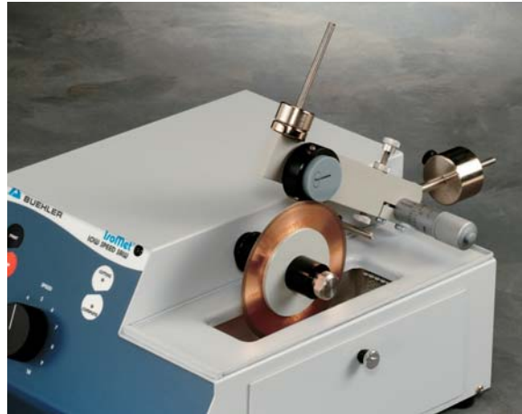
Mounted samples can be sectioned effectively with proper selection of chucks and flanges.