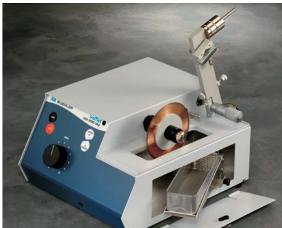
Sectioned samples are easily retrieved through the side coolant tray door and basket.