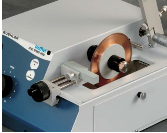
The optional dressing chuck (No. 11-1196) allows dressing of the wafering blade without interrupting the sectioning process.